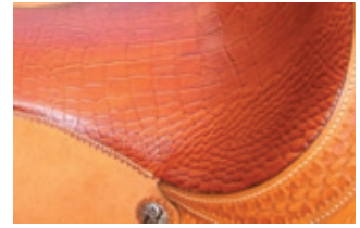
BROWN SEAT INSET

BARREL SADDLE, BASKET TOOLED AND ROUGH OUT CTI-24328 Barrel Saddle, 13-1/2", Brown Seat CTI-24328-1 Barrel Saddle, 14-1/2", Brown Seat CTI-24328-2 Barrel Saddle, 15-1/2", Brown Seat