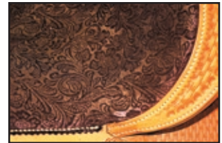
BLACK SEAT INSET